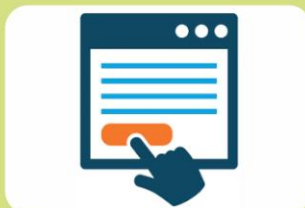
Application for the Subsidy