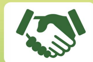
Branding & Marketing