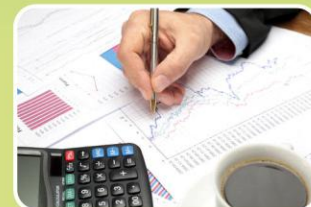
DPR and FUPs