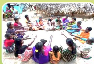
Support to FPOs/ SHGs/ Cooperatives